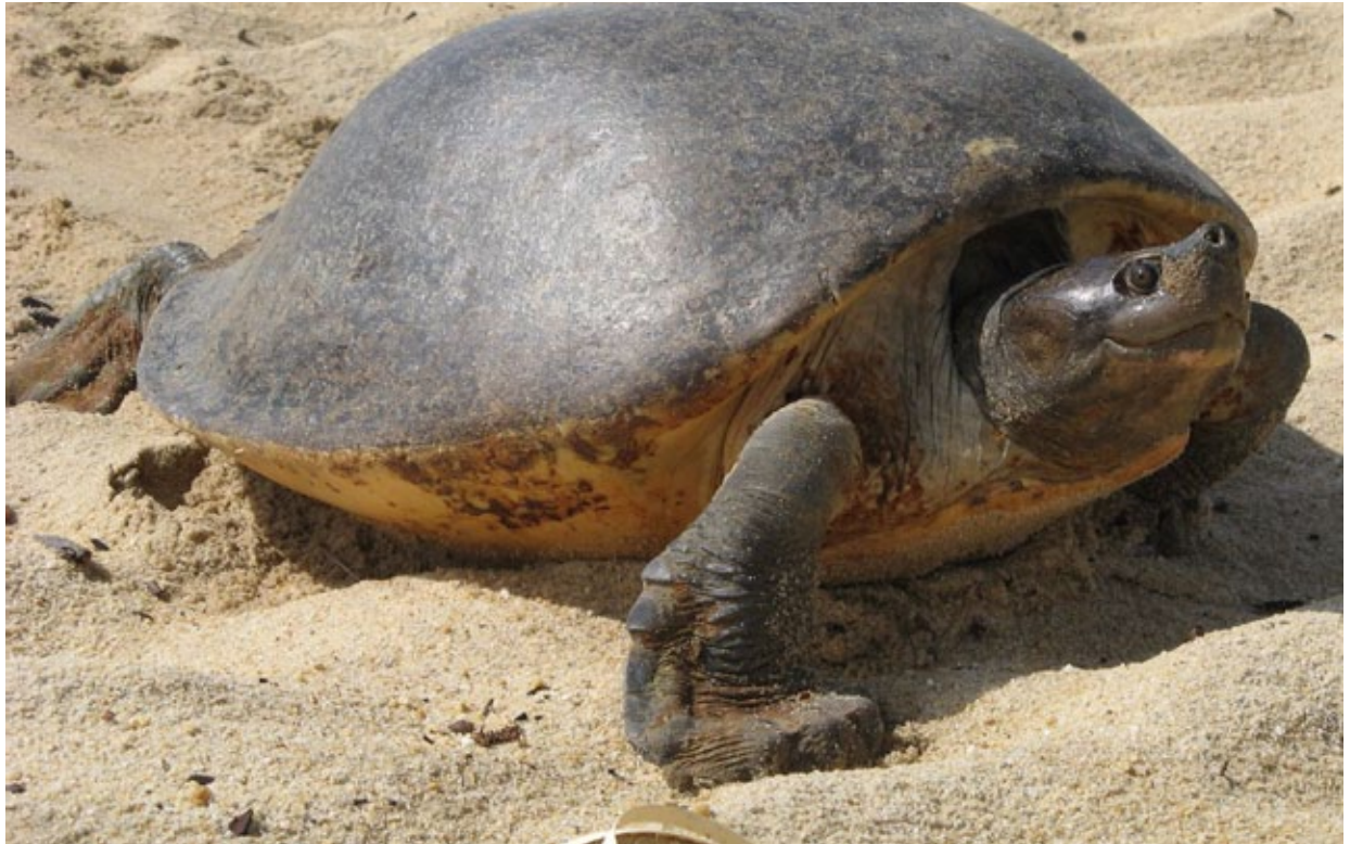
An adult female River Terrapin.