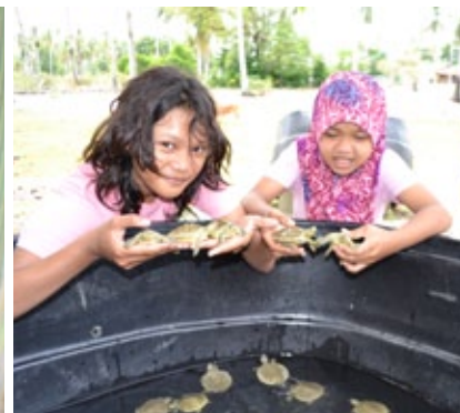
Local children holding River Terrapin hatchlings.

In Kemaman, three villages are involved in the project, i.e. Kg. Tok Kapor in Binjai, Kg. Pasir Gajah and Kg. Dadong. A total of 1,468 eggs from 126 nests were incubated this year, producing 975 hatchlings.